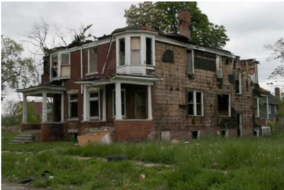
Abandoned house on Detroit's east side